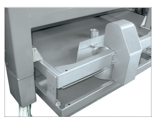
Dynamic trough for the reception of juices Rear view of press