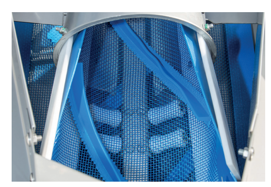
Patented draining and conveying belt