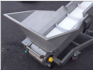
Hopper at the end of sorting table (accessory)