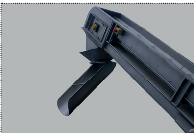
Directional gully on swivel (option)