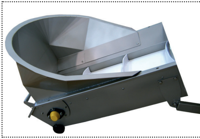
Hopper under destemmer (accessory)