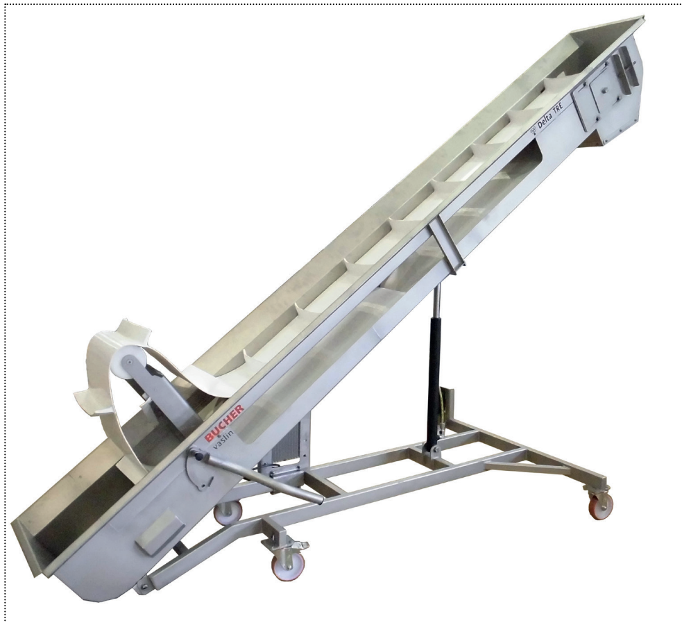
Delta TRE 300 with hopper under destemmer