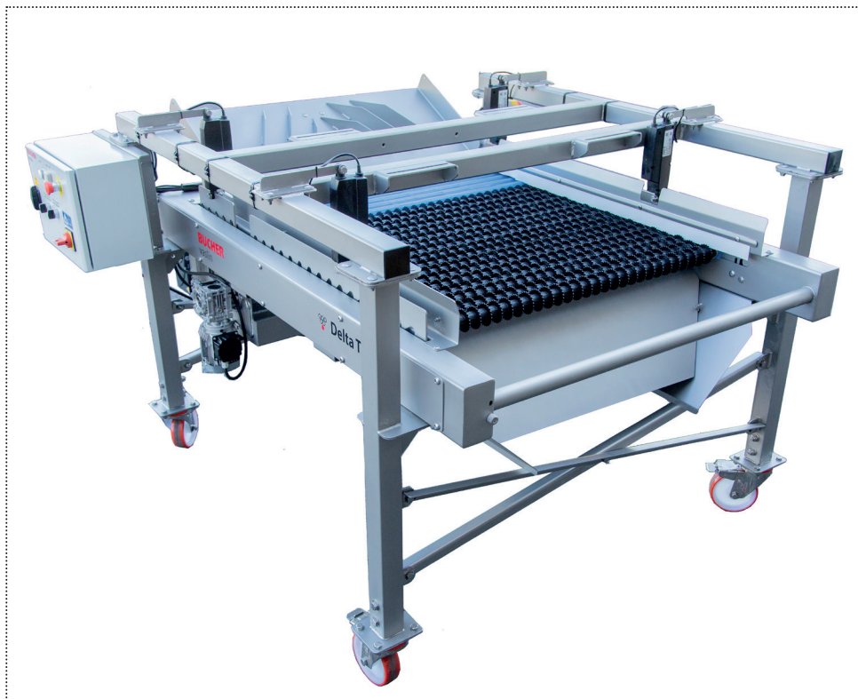
Delta Trio XM