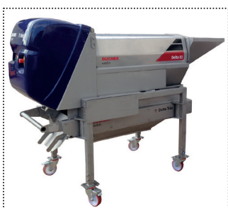
Delta Trio XS under destemmer Delta E2