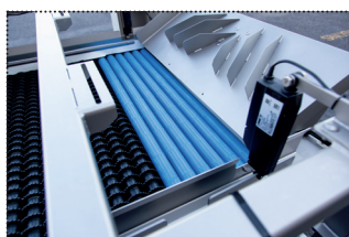
Feeding hopper and roller-driven cylinders (Delta Trio XS / XM)