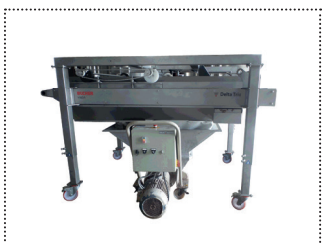
Delta Trio XL