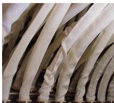
Drainage loops inside the tank