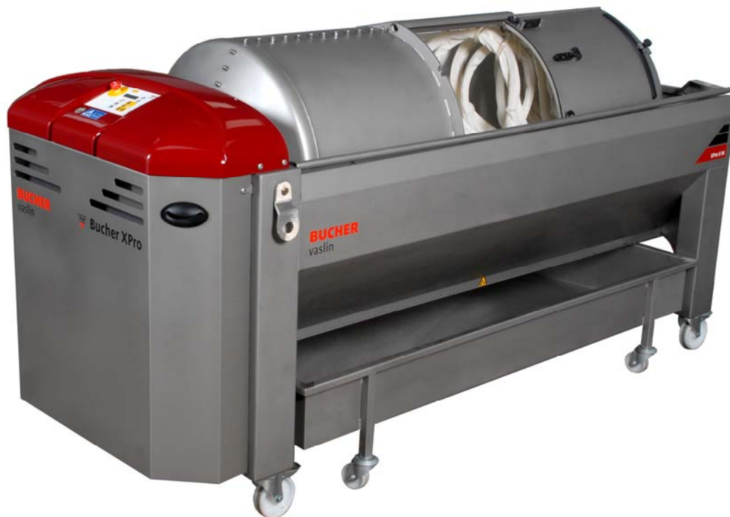
Bucher XPro 8 M

The technology of the Bucher XPro presses for fruits, enables to obtain an optimal quality of juice in a shortest processing time with a high throughput rate.