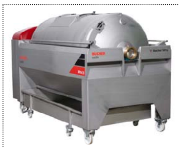
Axial inlet – XPro 15 M (optional)