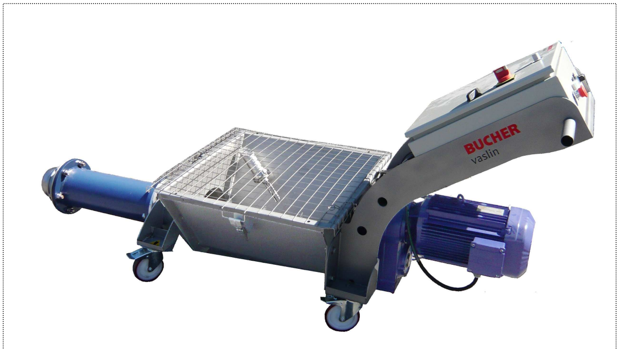
Delta PMV 2

In the heart of the vinification process, the Delta PMV pumps receive the fresh grapes and are adapted to the transfer of fermented pomace (except for Delta PMV1).